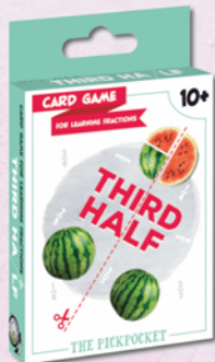
Card Game FRACTIONS