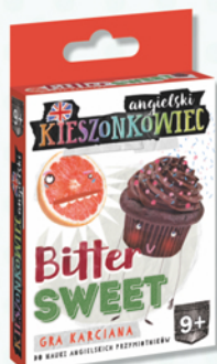
The English Pickpocket Bitter Sweet (age 9+)