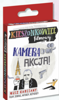
The Cinematic Pickpocket The Film Buff