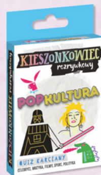
The Entertaining Pickpocket Popculture