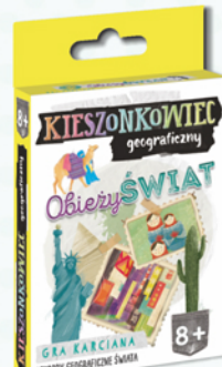
The Geographical Pickpocket Globetrotter