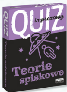
Party Quiz Theory of Conspiracy