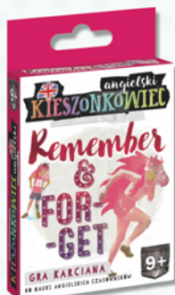
The English Pickpocket Remember Forget (age 9+)