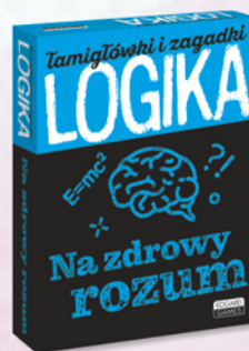
Party Quiz Common Sense