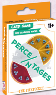
Card Game Percentages