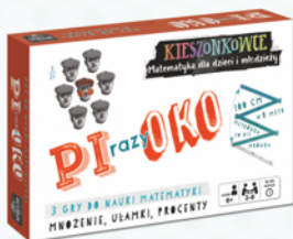
More Or Less. Maths For Kids And Teens

Set of three quizzes (on general knowledge, cinema, Tv series and pop culture) and games for learners of English and Maths.