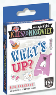
The English Pickpocket What's up? (age 15+)