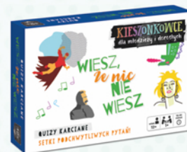
You Know That You Know Nothing