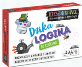
The Logical Pickpocket. Wild Brain to the Cube