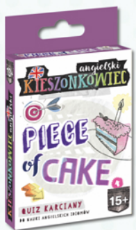
The English Pickpocket Piece of Cake (age 15+)