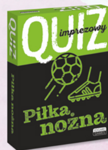
Party Quiz Football