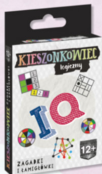
The Logical Pickpocket IQ (age 12+)