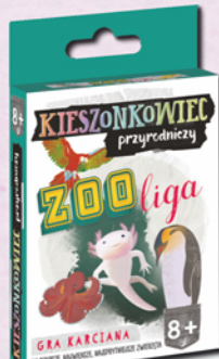
The Environmental Pickpocket Animal Kingdom