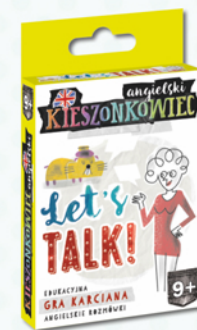
The English Pickpocket Let's Talk (age 9+)