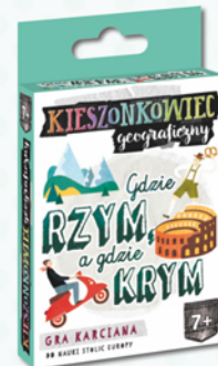
The Geographical Pickpocket European Capitals

Frustrated with Maths, English or Geography? With the SCHOOL Pickpockets you will perfect multiplication, fractions, English vocabulary and European capitals in no time!