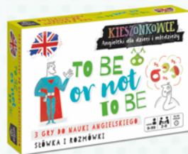
English For Kids And Teens. To Be Or Not To Be