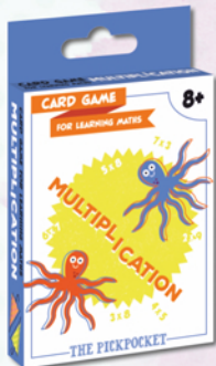
Card Games Multiplication